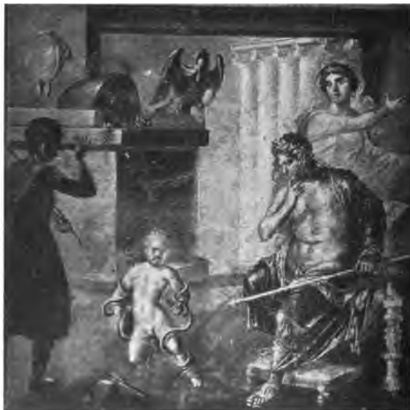
Fig. 65. Heracles strangling the Serpents.

So Heracles, commonly known as Amphitryon's son, grew strong and active; from his father